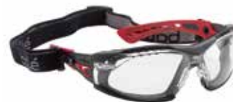
RUSHPFSPSI (Rush+ clear with foam & strap)